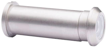
160° cUL DOOR VIEWER