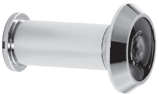
180° cUL DOOR VIEWER