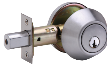
SINGLE CYLINDER DEADBOLT