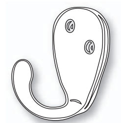
ILLUSTRATION DESCRIPTION FINISH MODEL# CASE QTY.